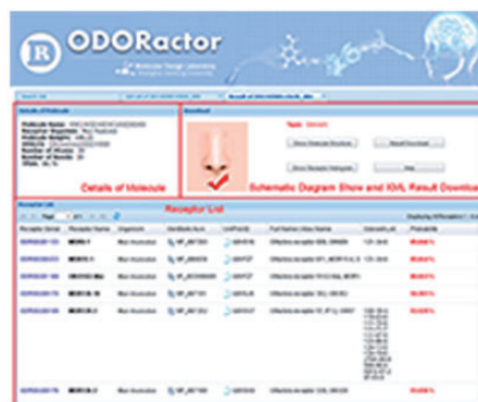
Figure 3. ODORactor results that demonstrate probabilities for interaction between an organic molecule queried (using the SMILES input format) and mouse ORs. The figure shows that there are six possible receptors that are likely to bind the organic molecule with probabilities ranging from 85 to 95%. Links to the receptors in GenBank, UniProt and other olfactory databases are also indicated.

The ODORactor server presents novel approaches towards identifying and predicting ORs that might be activated (or inhibited) by small molecule compounds. To accomplish this, two independent models are employed: the first is a classification model for odorants, in which a query (putative odorant) molecule is associated with one or more of over 300 physicochemical descriptors, and used to train a support vector machine (SVM) model. This is followed by another probability-based classification model for receptor recognition, in which both physicochemical descriptors on odorants and PseAAC (pseudo amino acid composition)