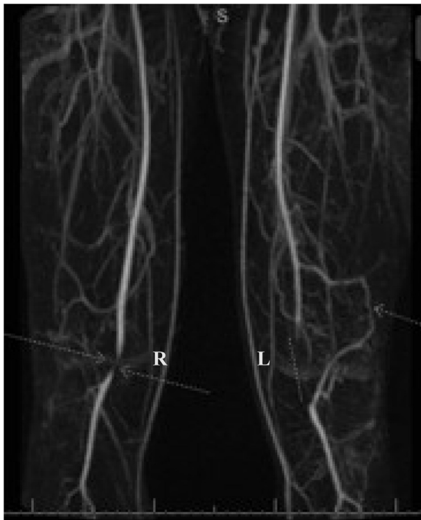
Fig 1. Magnetic resonance angiography (MRA) of bilateral lower extremities showing popliteal artery entrapment. The right (R) side shows compression, and the left (L) popliteal artery was occluded with a large collateral vessel.