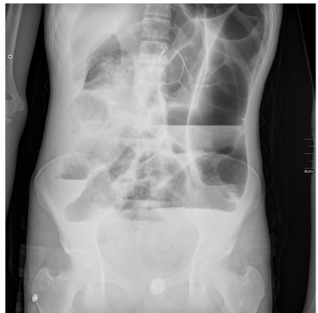
Fig. 2. Plain abdominal X-ray in erect position showing multiple air-fluid levels, a dilated bowel loop and gasless rectum.

sively redundant. Other abdominal organs were assessed and were intact. The volvulus was detorsed in a counter-clockwise fashion. We performed a transverse colectomy with side-to-side anastomosis using gastrointestinal anastomosis (GIA) stapler. The patient had a satisfactory postoperative recovery and was discharged from the hospital seven days later. Histologically, the resected part had no acute inflammation, infarction, granulomas, dysplasia, malignancy, or vascular abnormality.