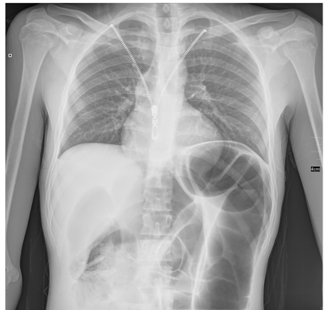
Fig. 1. Radiograph of the chest showing massively dilated bowel loop in left upper quadrant.

The abdomen was prepped and draped in the routine manner. A midline lower abdominal incision was made with subsequent opening in layers. Intra-operatively, rotation of the transverse colon on its mesentery was detected, resulting in a closed loop obstruction (Fig. 4). The point of twist was found to be in the left upper quadrant. The bowel was healthy-looking with no gross signs of ischemia. The transverse colon was abnormally lengthy and exces-