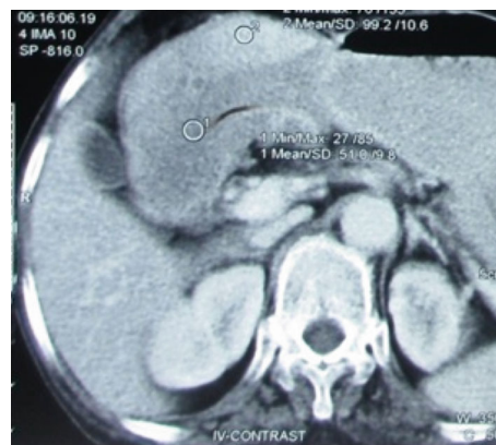
FIGURE 1: Axial computed tomography image of the abdomen showing a thickened wall of the stomach at the body and pyloric end.

Clinically, the disease is insidious with a progressive clinical course and classically present with gastrointestinal symptoms, peripheral edema, and giant gastric folds. The most common gastrointestinal symptoms include epigastric pain, anorexia, weight loss, and vomiting which are similar to those of the present case study. Abnormal enteric protein loss