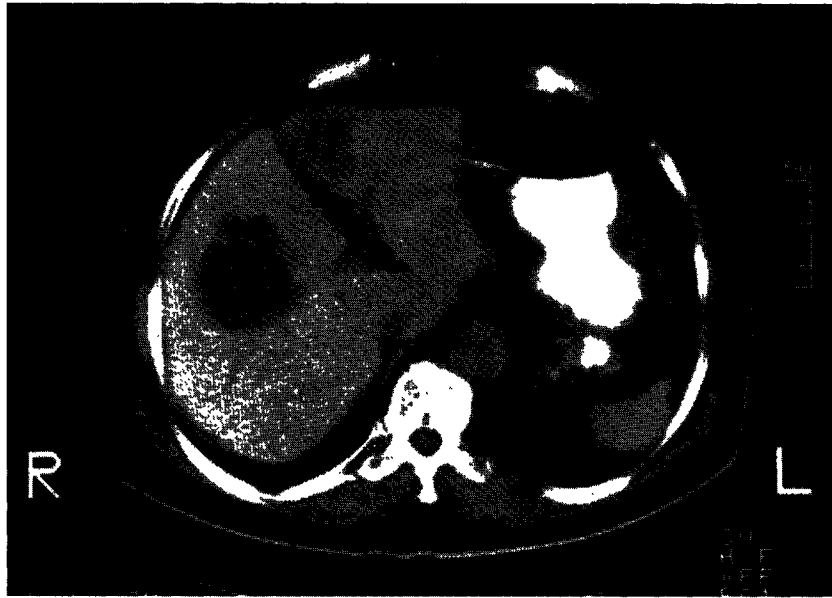
Figure 3 Six months after treatment, CT showed the cyst had disappeared without recurrence.

sive application of US and CT, asymptomatic congenital hepatic cysts are being increasingly identified 9,10 . Most patients have congenital hepatic cysts which are small and asymptomatic, but occasionally large cysts may form a mass in the upper abdomen and vague gastrointestinal discomfort ensues. Asymptomatic liver cysts do not require treatment, when there is no evidence of a malignancy or when spontaneous rupture of the liver cyst does not occur. The occurrence of carcinoma in solitary non-parasitic cysts of the liver is rare 11 , as is of spontaneous rupture of cysts 12 .