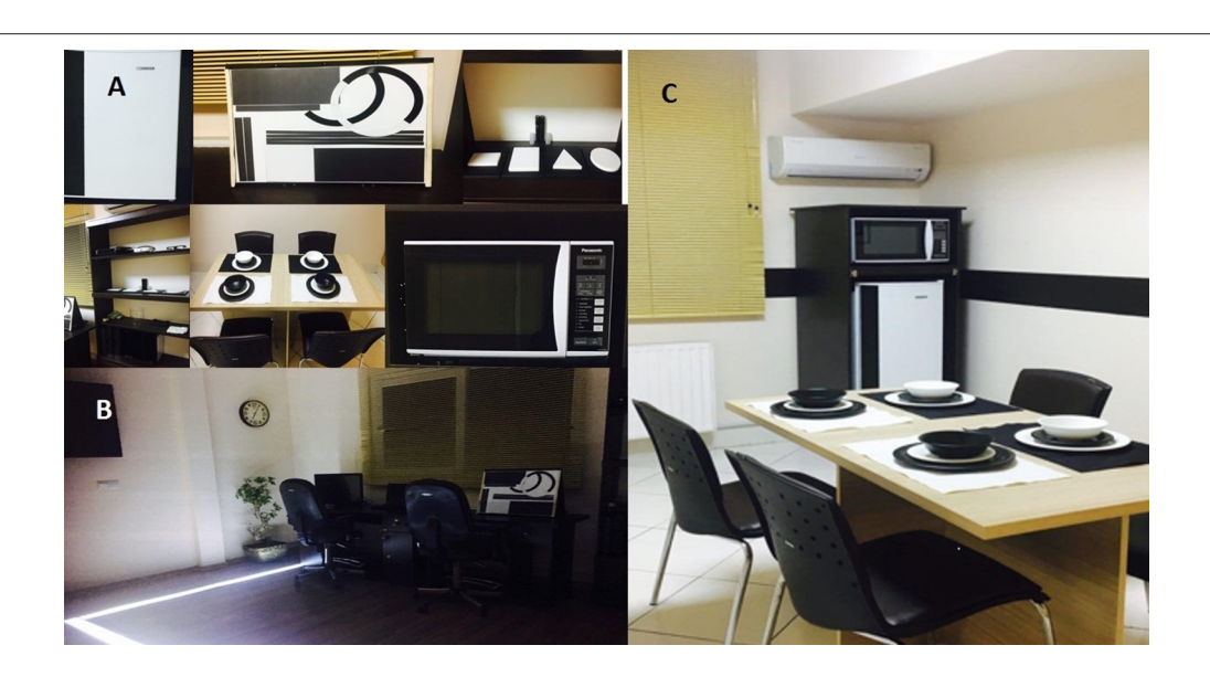
FIGURE 3 Visual and functional rehabilitation platforms including a set of equipment as per the guidelines and recommendations laid down by the Argus II system developer though which serial rehabilitation sessions would be completed to improve functional vision. The visual rehabilitation process is followed intermittently in visual rehabilitation unit and functional rehabilitation set up. Things to consider include contrast modifications, lighting evaluation and contrast evaluation when trainings are provided. It is also recommended to similarly customize the environment of the patients' home. (A) The functional rehabilitation unit where subjects are trained to undertake target localization tasks on a magnet board, touch items, focus of contrasts and edges detection with the system ON, and to interact with the customized environment by locating and working with the microwave oven, fridge, locating black and white bowls, plates and table cloth, etc. (B) The visual rehabilitation setup comprising the grating visual acuity task on computer monitors, visual rehabilitation kit provided by the developer and the line-task in which the subject needs to track the path of light-emitting target on the floor. (C) Another view from the functional rehabilitation unit designed for subjects using the Argus II device. Images from Farvardin Eye Clinic, Shiraz, Iran.

(less than 50 k \Omega ). All 4 patients were able to perceive hand motion and vague pattern recognition following the fitting procedure.