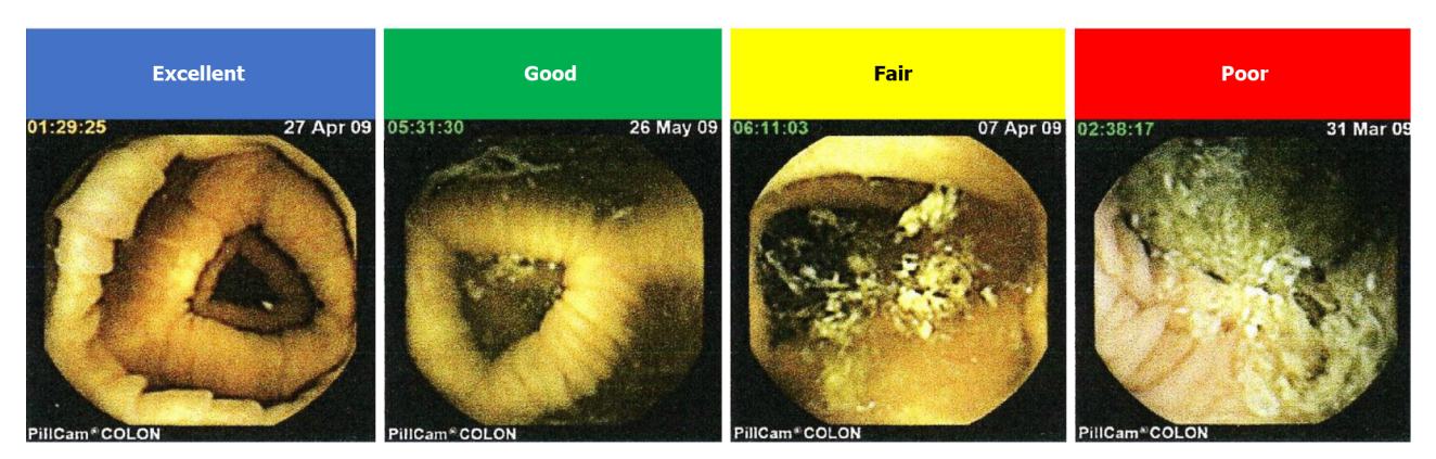
Figure 2 Degree of the colon cleansing level in different segments of the colorectum (cecum, ascending colon, transverse colon, descending-sigmoid colon, and rectum).