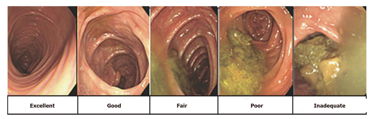
Figure 1 Aronchick Global Assessment Scale[17].

diagnosis between CCE and colonoscopy were those bearing colon polyps \leq 5 mm because the diagnostic accuracy for small polyps \leq 5 mm was low. Indeed, the sensitivity, specificity, and diagnostic accuracy rates in detecting adenoma ≤ 5 mm were 50.0%, 66.7%, and 55.6%, respectively (Table 4). Regarding the detection of diverticulum, the sensitivity, specificity, and diagnostic accuracy rates were all 100%