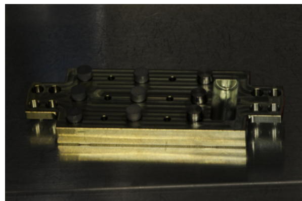
Fig. 1. Titanium discs with turned, sandblasted/acid-etched and titanium plasma sprayed surface inserted on a metallic holder and treated in the argon plasma chamber.

tained from a healthy male donor, who had not assumed any medication for 3 months prior to the study. The protocol was approved by the Ethics Committee and a specific informed consent was signed by participants. After 24 hours, a half of the contaminated discs (control group) were washed three times with PBS to remove the planktonic and loosely attached bacteria and transferred to a 15 ml Falcon tube containing 1 ml of PBS. The tubes were sonicated for 1 min at 100% intensity for the disruption of the biofilms. Sonication fluid was diluted and all serial dilutions were then used to evaluate the colony forming units (CFUs). The other half of the contaminated discs (test group) were inserted on a metallic holder and treated in an argon plasma chamber (Plasma R, Sweden & Martina, Padua, Italy) for 12 minutes at room temperature (Fig. 1) prior to be washed, sonicated and analyzed for CFU counting as above mentioned. All assays were performed using triplicate samples of each material in 3 different experiments.