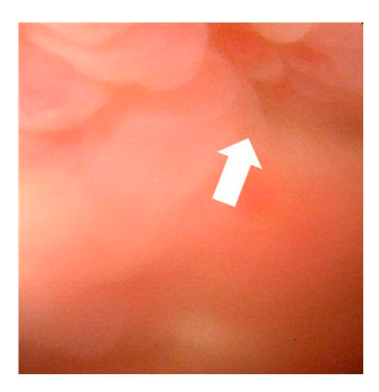
Figure 3. Cystoscopy on the day of 4th admission. Cystoscopy showed no tumor or fistula, but showed granular edematous mucosa in the same part of wall thinning on computed tomography at 4th admission (white arrow).

Figure 2. Abdominal plain computed tomography on the day of 4th admission. Abdominal plain computed tomography showed massive ascites and partial wall thinning (white arrow) in the dome of the bladder. ( A ) coronal image; ( B ) sagittal image).