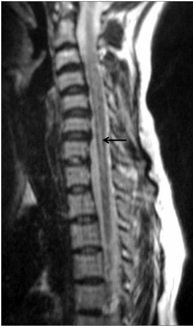
Figure 1: Sagittal T2W MRI image of the cervical spine shows central hyperintensity (arrow) extending from C3 to C7

can cause signal changes in both the brain and the cervical spine on MRI. Further investigations included EEG (which revealed periodic discharges every 3–5 s) and serum and CSF anti-measles IgG antibody levels (which gave test values of 2.734 and 1.396 as against control values of 0.524 and 0.258, respectively). Diagnosis of SSPE was made after extensive exclusion of other diseases and on the basis of the clinical presentation, EEG, anti-measles antibody titers, and characteristic MRI brain findings.