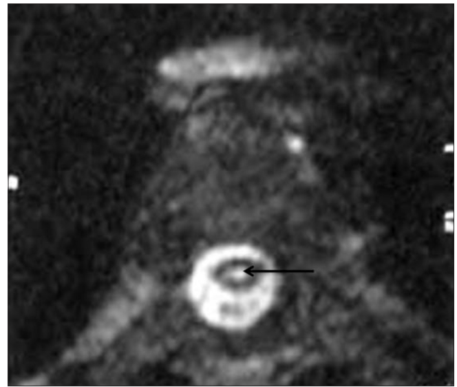
Figure 2: Axial T2W MRI image of the cervical cord better demonstrates the central cervical cord hyperintensity (arrow)

SSPE is a slowly progressive inflammatory and degenerative disorder of the brain that is caused by a mutant measles