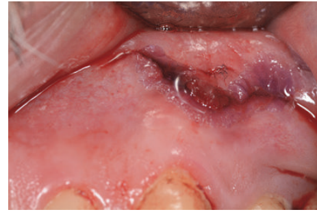
FIGURE 1: Wound closure in a moist environment during an apical surgery with an adhesive composed of n-butyl-cyanoacrylate and octyl cyanoacrylate.

In the field of esthetic surgery, cyanoacrylate adhesives have been used for wound closure and in skin grafting procedures, blepharoplasty, face and brow lifts, and other cosmetic surgeries [32]. Moreover, they have been used for