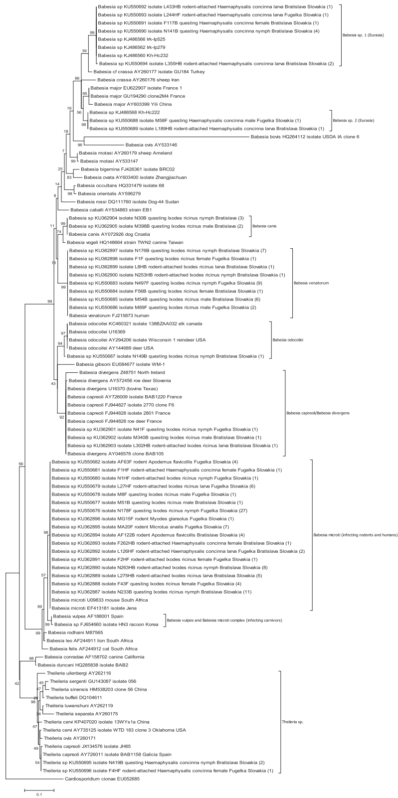
Fig. 2 (See legend on next page.)