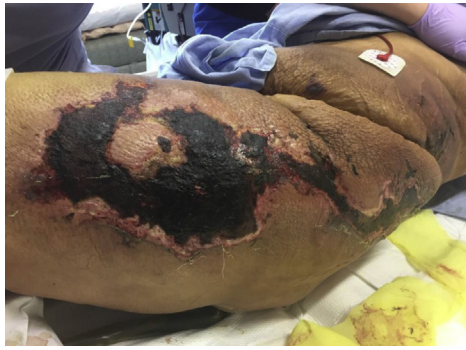
Fig 1. Greater than 20 cm retiform purpuric plaques with central necrotic eschar and surrounding indurated stellate red-brown plaques with peau d'orange on the left thigh.