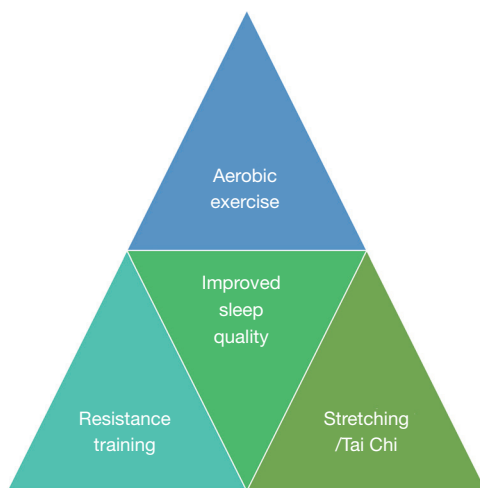
Figure 1 Modalities of exercise that have been demonstrated to improve sleep quality in patients with insomnia.

and larger prospective studies are needed to determine its value definitively (47).