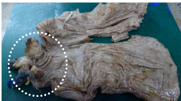
Fig. 2 – Surgical resection of neoplasm (circle).