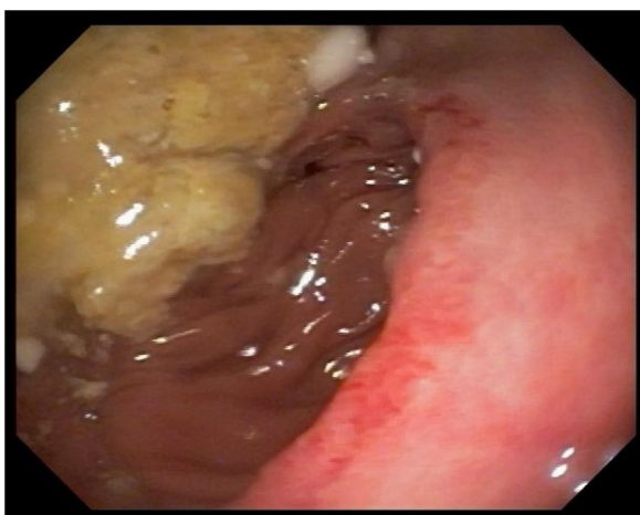
Fig. 3 – Post-operative control: gastroenteric anastomosis with no lesion or gastric food residue.

Vancomycin and piperacillin-tazobactam were already finished and patient was on monotherapy with fluconazole 800 mg once a day. Catheter site was switched again and amphotericin B 50 mg once a day was associated, with resolution of fever. After 14 days of combined therapy and negative peripheral cultures, patient was discharged with a dosage of 800 mg oral fluconazole daily. A post-operative control CAT-scan and an upper digestive endoscopy were performed, showing no signs of recurrence of the neoplasm (Fig. 3).