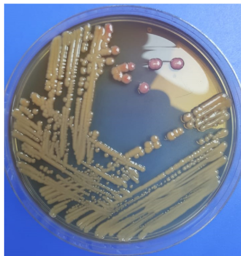
Fig. A2. Growth of lactose fermenter on MacConkey agar.

A sixty three years old female known case of hypertension, ischemic heart disease with heart failure (ejection fraction of 35%), chronic obstructive pulmonary disease (requiring long term oxygen therapy and BIPAP) with secondary pulmonary artery hypertension and chronic kidney disease, had a recent prolonged admission of 2 months elsewhere, for lower respiratory tract and urinary tract infections. During the course of this illness she underwent seven sessions of hemodialysis through perma catheter for acute on chronic kidney injury complicated by pulmonary oedema and received meropenem and vancomycin. She was shifted to the Indus hospital due to financial constraints. Two blood cultures from perma catheter on admission at our hospital grew methicillin resistant Staphylococcus epidermidis (MRSE) for which vancomycin was continued. Peripheral blood culture grew Pseudomonas spp and based on the sensitivity pattern antibiotic was de-escalated from meropenem to ceftazidime. Urine culture grew Raoultella terrigena sensitive only to colistin and fosfomycin, hence considering her recent hospitalization, catheterization history and acute on chronic kidney injury, oral fosfomycin was started to treat Raoultella infection. She cleared all 3 cultures but deteriorated due to multiple comorbidities and patient's attendants shifted her to another tertiary care hospital.