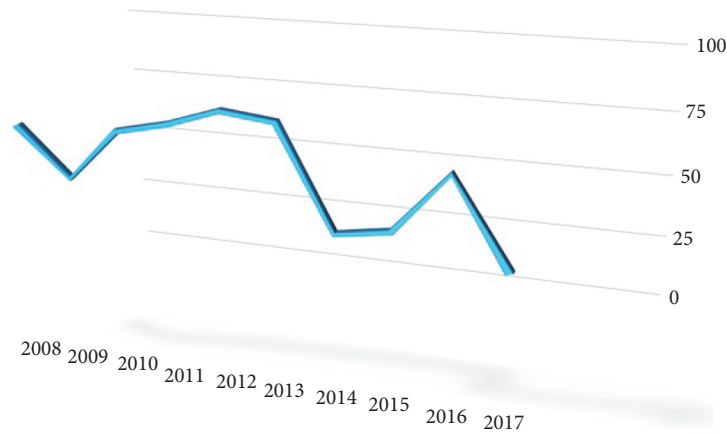
FIGURE 1: Distribution of the experimental animal research studies published in SCI-E emergency medicine journals according to years.