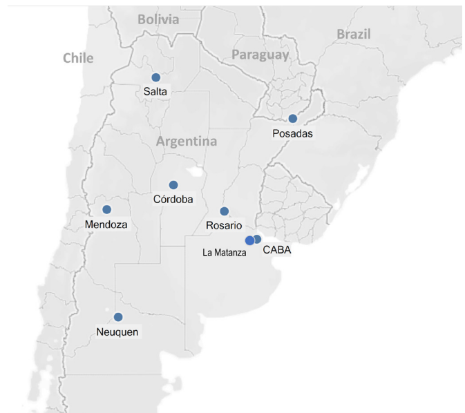
Figure 1 Location of the eight Argentinean cities included in the study.

A trained collector was instructed to recover every discarded cigarette pack along a route starting at the centre of each selected fraction and walking around four city blocks (400 m in perimeter