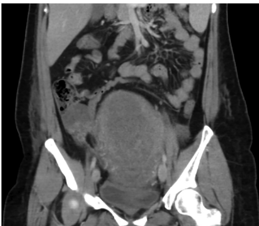
Fig. 2. Abdominal computed tomography (CT) scan demonstrating a large soft-tissue mass distending the uterus.

The patient was transferred to the medical oncology team. A computed tomography scan of her chest, abdomen and pelvis four weeks post-partum demonstrated a large soft-tissue mass distending the uterine cavity, with possible extension into the right adnexa, without evidence of distant metastatic disease (Fig. 2). The patient was commenced on methotrexate therapy and serum \beta -HCG levels were monitored. Although the \beta -HCG level initially decreased appropriately,