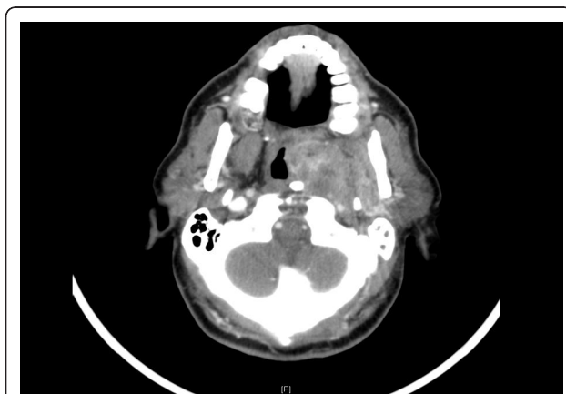
Figure 1 CT scan showing left parapharyngeal soft tissue mass protruding into oro and nasopharynx.

He underwent surgical excision of left parapharyngeal mass along with left parotidectomy and left level II neck node dissection on 1/5/2011. The tumor consisted of multiple small and large variegated gray white to tan firm pieces of tissue measuring in aggregate 8 \times 7 \times 1.5 cm. Histopathology showed vascular neoplasm consisted