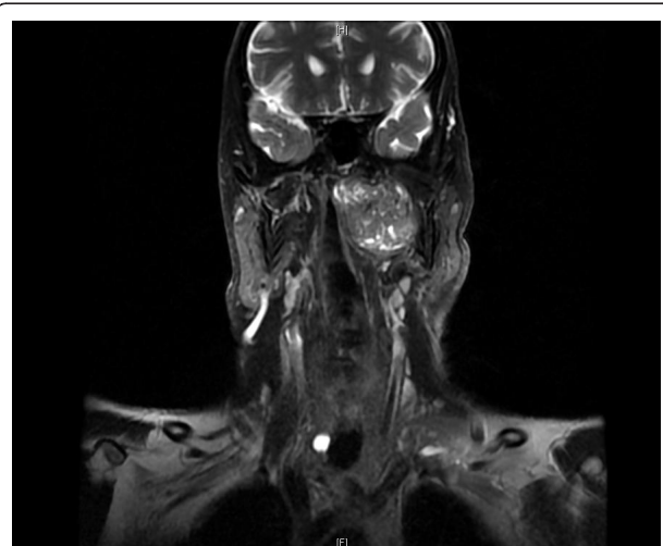
Figure 2 MRI showing 5 \times 6 \times 3.3 cm enhancing left parapharyngeal mass compressing the upper internal jugular vein.