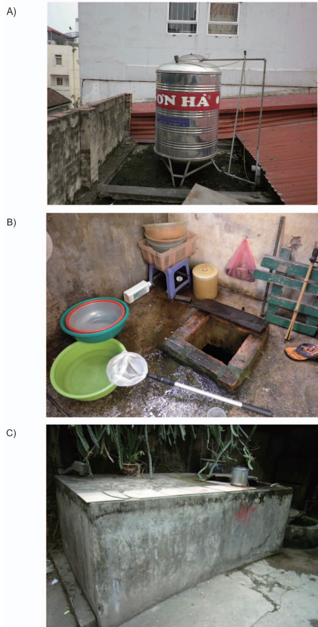
Figure 1. Typical water tanks in Hanoi. A) Roof-top metal tank. B) Underground concrete tank. C) Above-ground concrete tank. doi:10.1371/journal.pone.0095606.g001

The lowest Hanoi outside air temperature in January was 9.0^{\circ}\text{C} in 2011 and 8.0^{\circ}\text{C} in 2012 [15]. The mean outside air temperatures were lower than room temperatures, metal tank, and the concrete tank temperatures (Table 1). The mean concrete tank water temperature was higher than other temperatures in 2011 and 2012. The difference was not significant between the mean of outside air temperature and metal tank water temperature. However, outside air temperature and room temperature