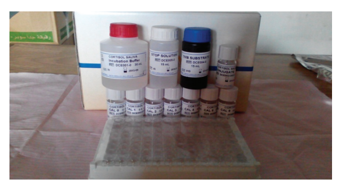
Figure 2: Cortisol saliva enzyme-link immunosorbent assay kit