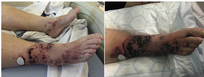
Fig. 1. Images taken on the first day and a week later showing palpable purpura and violaceous macules becoming confluent with superficial skin necrosis: Left 17th Feb 2015, Right 24th Feb 2015.

her elderly husband in Ireland, the surgery was postponed and letrozole was started in the meantime. She was taking amlodipine and bendroflumethiazide for hypertension, digoxin and aspirin for atrial fibrillation, simvastatin, occasionally a salbutamol inhaler for asthma, and co-codamol for knee pain. She has no known drug allergies.