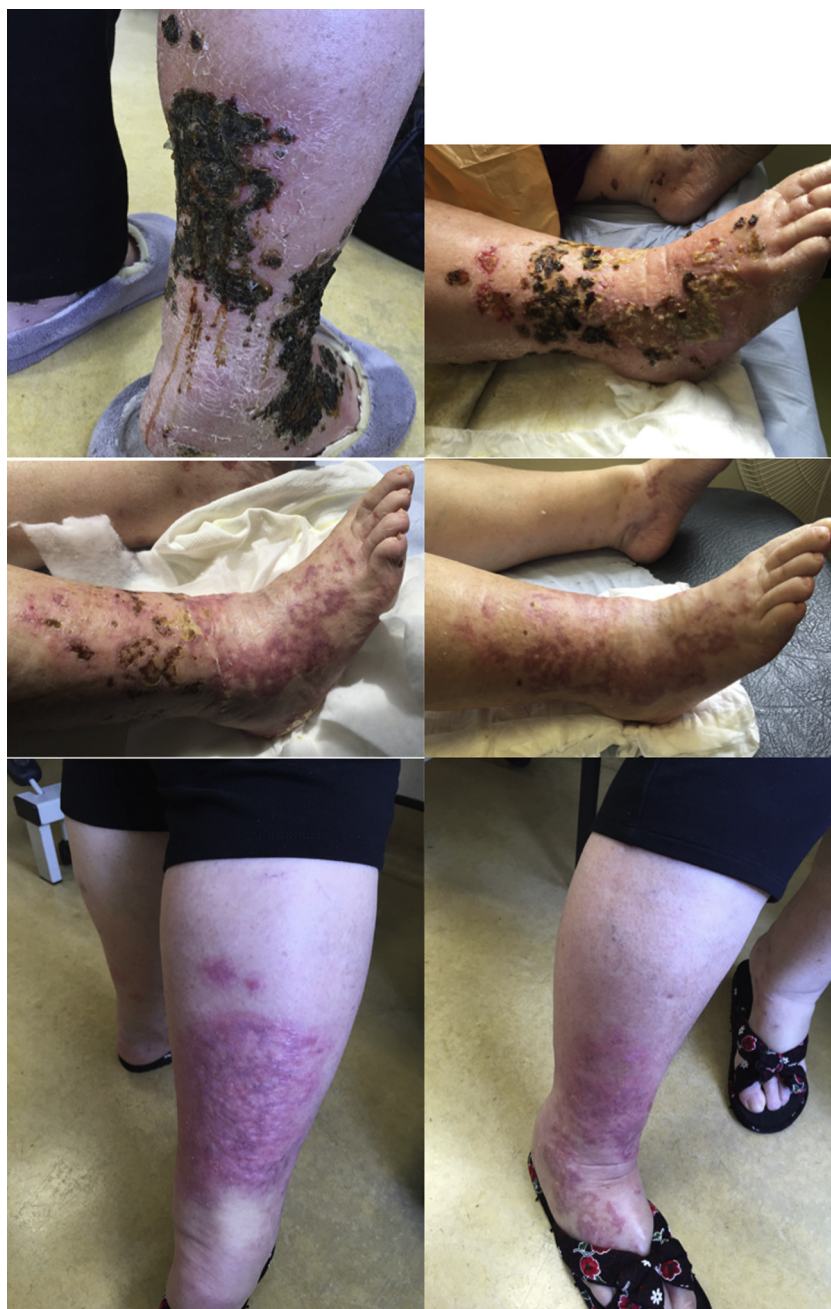
Fig. 3. The lesions at 1 month top left (18th March 2015), 6 weeks top right (30th March 2015), 12 weeks middle left (11th May 2015), 14 weeks middle right (20th May 2015), and 18 weeks bottom left and bottom right (both 15th June 2015).

connective tissue disease need to be ruled out by negative ANCA levels and through biopsy. Over 100 drugs have been known to cause either CLSVV or drug-induced lupus, though the absolute frequency of drug-induced vasculitis is approximately 1/100,000 people [10,11].