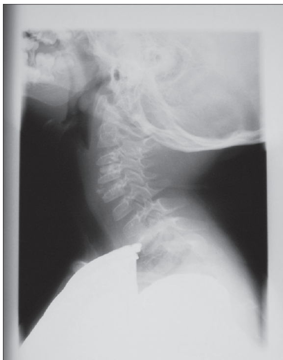
Figure 1. Lateral X-ray of cervical spine at retroversion reveals oval intervertebral disc calcification at the level of C2/C3 vertebrae as well as irregular calcifications at the C3/C4 level and calcification of the anterior longitudinal ligament.

In most cases, intervertebral disc calcifications within the cervical spine do not evoke clinical symptoms [5–7] and are diagnosed in an incidental manner upon X-ray examinations performed for other reasons [8]. The patient described in this study was presented at the physician's office due to pain symptoms and torticollis.