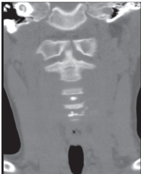
Figure 3. Coronal CT scan reveals calcifications at the C2/C3 level and calcifications in the anterior part of the C3/C4 intervertebral disc and in the anterior longitudinal ligament at the same level.

Complete regression of intervertebral disc calcifications as observed in X-ray images in the study groups occurred after 2–8 months [5,9,11].