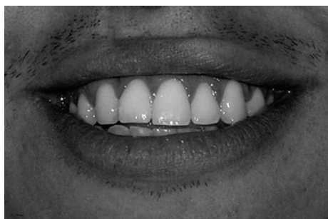
FIGURE 3: High smile.