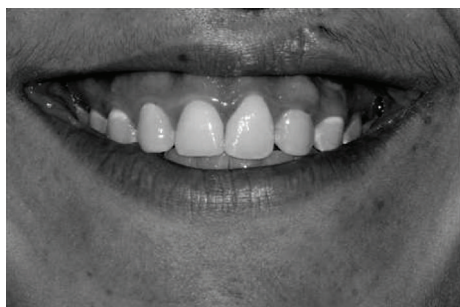
FIGURE 2: Very high smile.