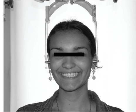
FIGURE 1: Photograph of patient in position, with the olives of the cephalostat placed in the cartilaginous tragus, during natural smile.

The sample was composed of 45 Caucasoid individuals with unilateral cleft lip, alveolus, and palate aged 15 to 30 years, of