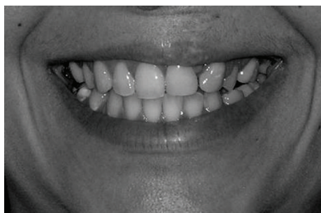
FIGURE 4: Average smile.