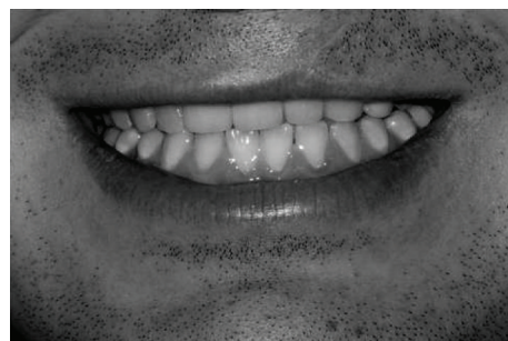
FIGURE 5: Low smile.