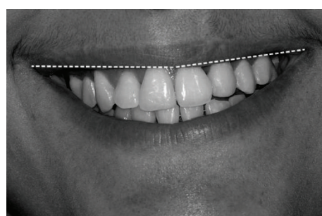
FIGURE 6: Straight curve of the upper lip at the patient's right side and slightly ascendant curve of the upper lip at the patient's left side.