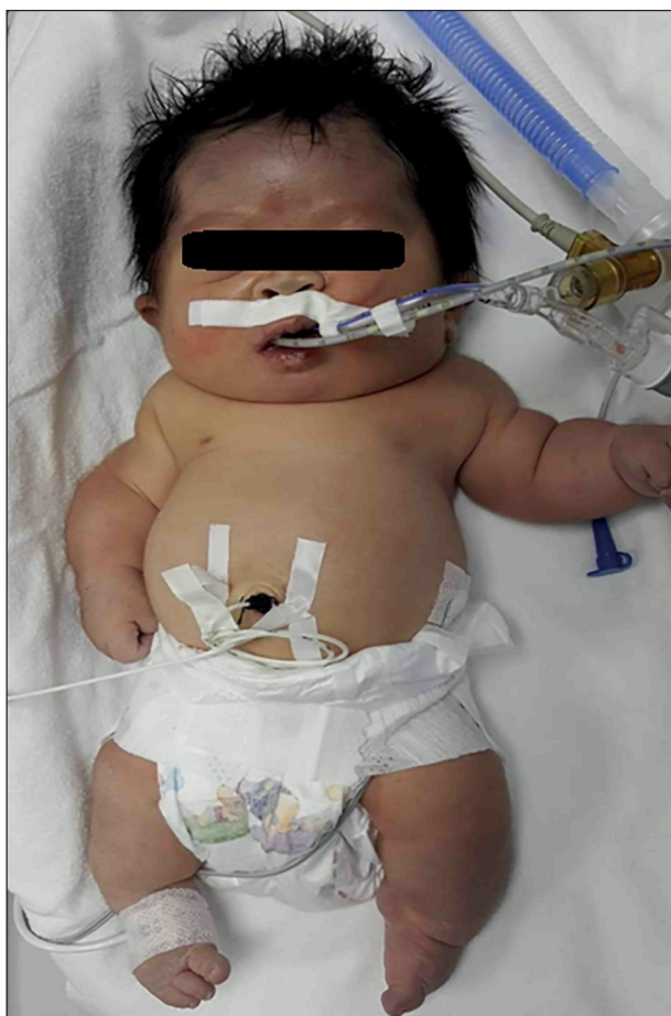
Figure 1. Typical appearance of the patient: short trunk, small thorax, distinctive abdomen and micromelia.

The patient had a 1 and 5 min. APGAR score of 4 and 5 at birth, respectively. The patient was intubated after delivery due to a lack of spontaneous respiration and was admitted to the Level III Neonatal Intensive Care Unit (NICU), Bursa, Turkey. The birth weight was 2780 gr (3-10 percentile), height was 38 cm (below 3 percentile), and head circumference was 37 cm (90-97 percentile). A physical examination revealed extremely short extremities, abdominal distention, a small chest, a prominent forehead and a flat nasal bridge (Figure 1). Ophthalmological exami-