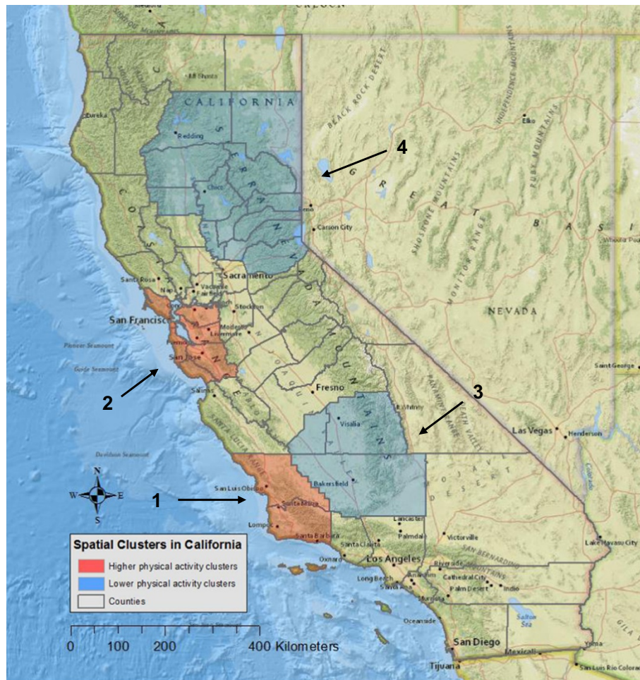
Figure 1 Spatial clusters of higher and lower likelihood of women meeting physical activity recommendations in California. The red color represents higher physical activity levels (clusters 1 and 2), whereas blue represents lower physical activity levels (clusters 3 and 4). All clusters are from unadjusted tests. Since the analyses were conducted at the county-level, clusters were visualized using a county boundary. The radius for each cluster was reported in Table 1.

respectively, had statistically significant higher population density (e.g., 2252 versus (vs.) 2003 persons/km 2 ), intersection density (e.g., 6.08 vs. 4.01), and diversity of facilities (e.g., 0.77 vs. 0.52) and facility density (consistent with higher walkability), compared to outside of clusters. Alternatively, the values for these built environment characteristics were significantly lower for women in three lower physical activity clusters (clusters 3 and 4 in California and cluster 7 in Massachusetts).