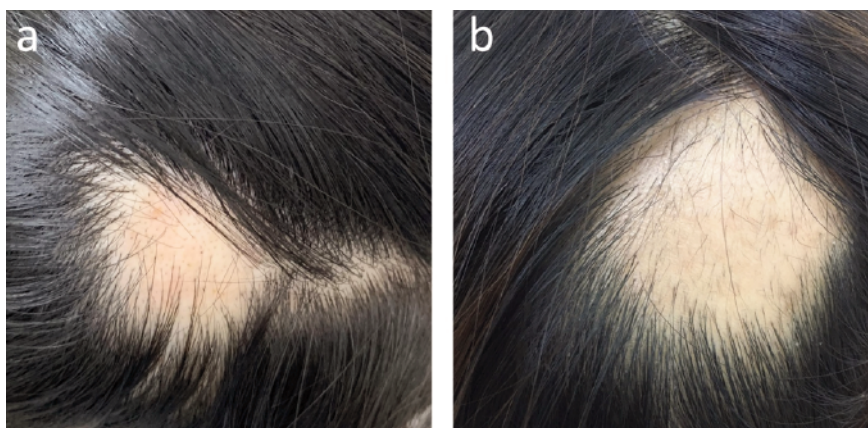
Figure 2. Two representative cases with different AA patch characteristics. a) A female patient with a single lesion lasting for 1 month had a significantly increased serum IL-17A level at 98.87 pg/mL. Mild edema and erythema were found and concurrent with itch. Nail involvement and atopic dermatitis were also noted in this patient. b) Another female patient with a history of 7 months of AA showed a single patch of AA. The exclamation mark hairs were found within the patch, but no other symptoms were described. The patient's serum IL-17A level of 3.6 pg/mL was low.