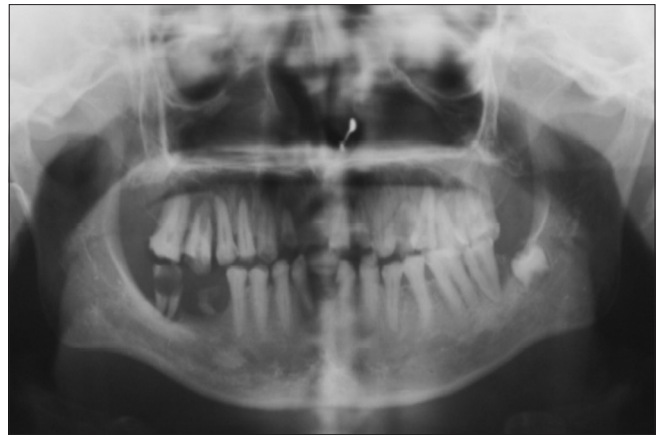
Figure 2: Panoramic Radiograph showing obliterated pulp chambers