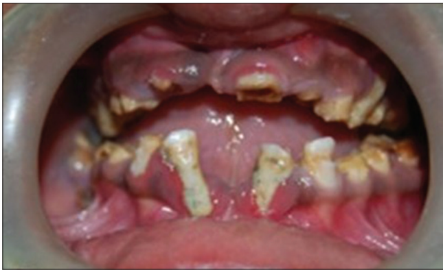
Figure 1: Intraoral view with brownish discoloration and severe attrition