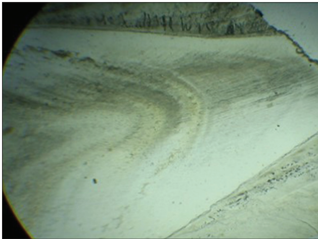
Figure 5: Photomicrograph showing obliterated pulp chamber

with syndromes are reported. Dentin defects occur as a feature in a number of syndromes, including osteogenesis imperfecta (OI), Ehlers-Danlos syndrome (EDS), tumoral calcinosis and hypophosphatemic rickets. [3]