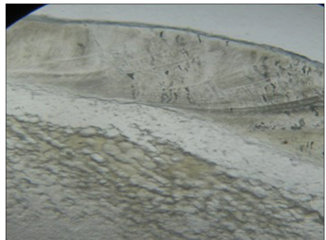
Figure 4: Photomicrograph showing increased interglobular dentin