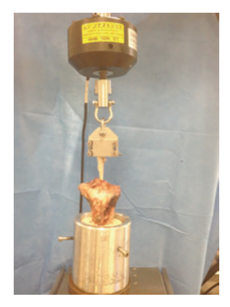
Figure 2. Macroscopic view of the experimental biomechanical setting.

Contradictory to the findings of Markolf et