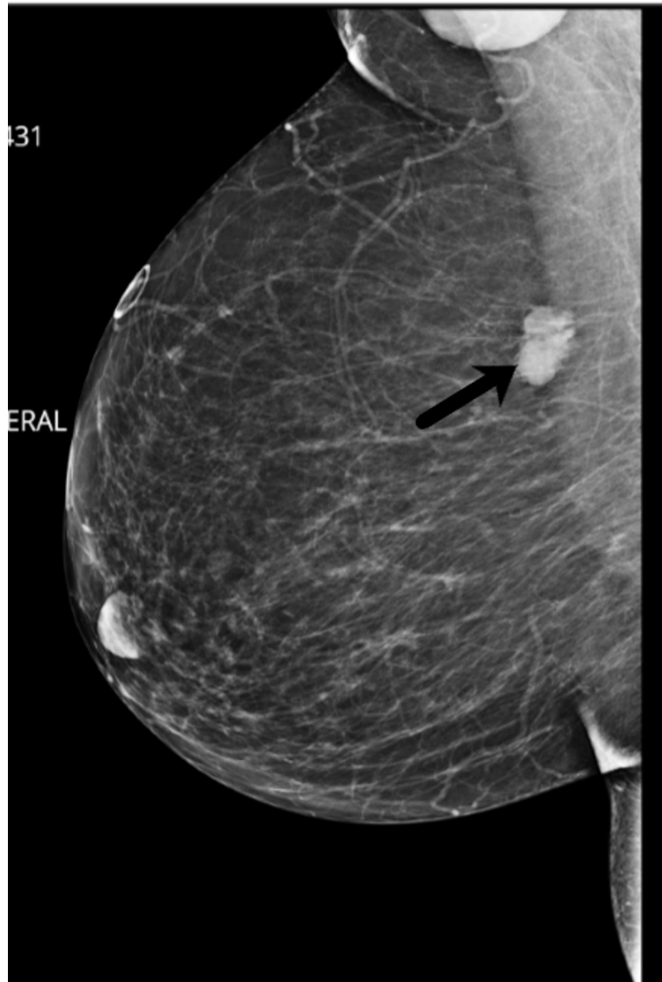
FIGURE 1: Mammogram with the concerning lesion

Black arrow indicating the lesion of consideration - a 2 cm, hyperdense mass with indistinct margins at approximately the 9 o'clock position of the right breast