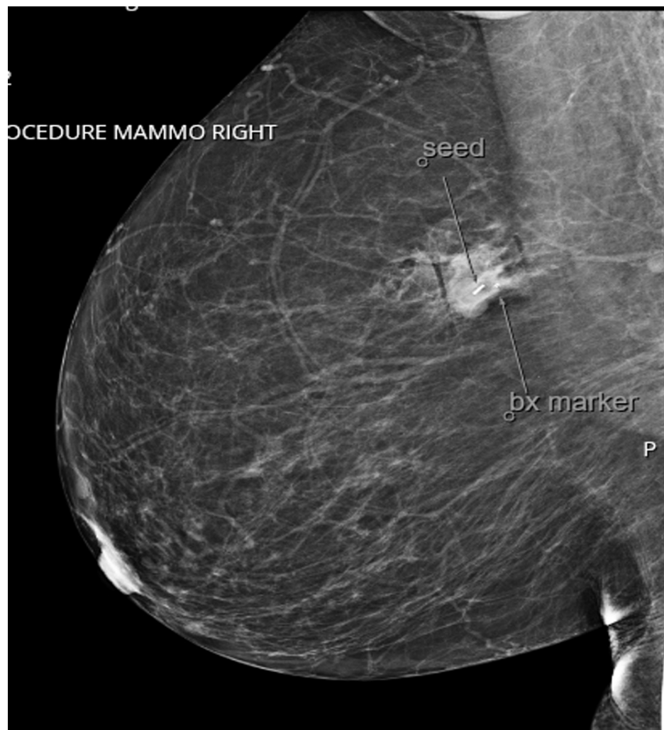
FIGURE 3: Post-procedure mammogram after insertion of seed