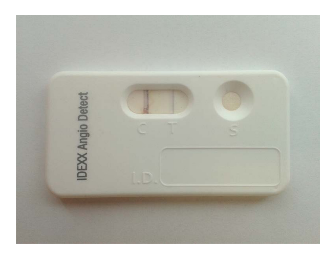
Figure 3 Positive result of the rapid in-clinic assay Angio Detect<sup>™</sup> Test (IDEXX Laboratories).

With regard to deoxyribonucleic acid (DNA)-based methods, some approaches have been recently developed to overcome the constraints of classical diagnostics. First, the characterization of the mitochondrial DNA (mtDNA) gene encoding for the cytochrome c oxidase subunit 1 of A. vasorum provided diagnostic genetic markers. Based on polymerase chain reaction (PCR) restriction fragment