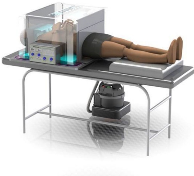
Fig. 5 Exovent—a recently developed negative pressure ventilator. This is the state of the art which is currently being presumed to treat COVID-19 due to its potential advantages over positive pressure ventilators.