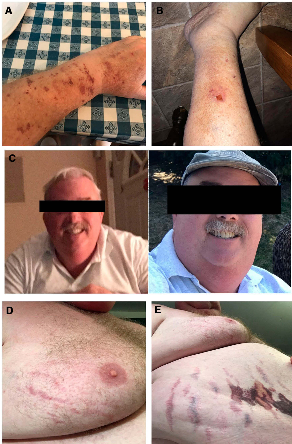
Figure 1 (A) Bruises on the left upper extremity, which developed after the second intra-articular injection. (B) Bruise on the left lower extremity which developed into a non-healing ulcer. (C) Cushingoid facies and facial plethora. The picture on the left was taken a week prior to the first intra-articular injection, and the second picture was taken nearly 2 months after the second injection. (D and E) Wide, violaceous striae on the chest (D) and abdomen (E).

next 2 months he experienced significant weight gain, cushingoid facies and facial plethora (Figure 1C). Five months later he developed sudden-onset shortness of breath and was found to have a PE via Computed Tomography Angiography (CTA) of the chest and a deep vein thrombosis (DVT) via