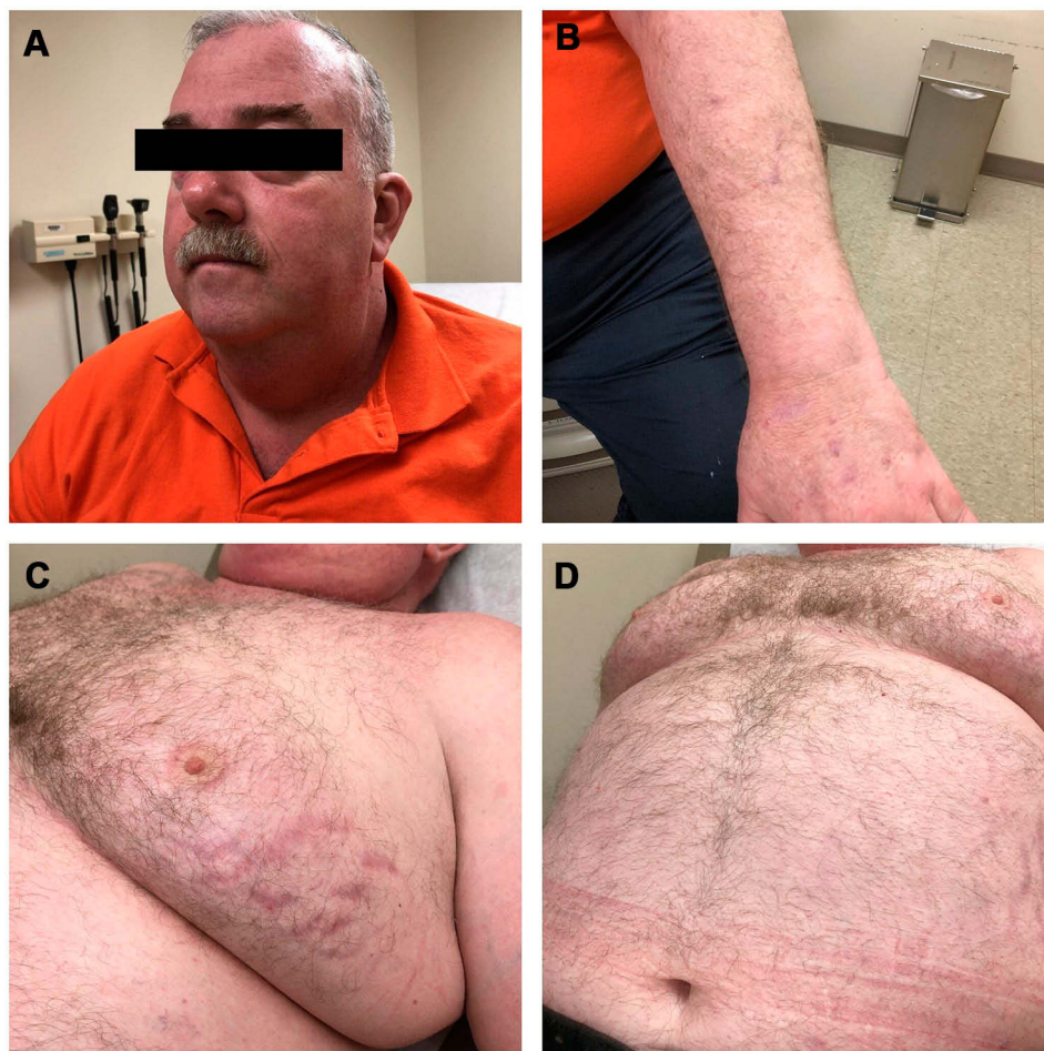
Figure 2 Follow-up images were collected at the patient's most recent outpatient appointment, 7 months after the first intra-articular injection, showing resolution of symptoms. Of note resolution of (A) Cushingoid facies, (B) extremity bruising, wide violaceous striae of the (C) chest and (D) abdomen.

It is often thought that inhaled, intranasal and intra-articular steroids do not have the same side effects as systemic steroids, but lately it has been shown that in certain populations, this is not the case. 7 Patients who are on medications that inhibit CYP450 metabolism in the liver – such as RTV and cobicistat – are at higher risk to develop ICS. In such patients it has been documented that they have developed ICS associated with a single dose of non-systemic steroids. 8 Many of these patients develop ICS that is accompanied by HPA axis suppression, as seen in our patient. 8 Other agents