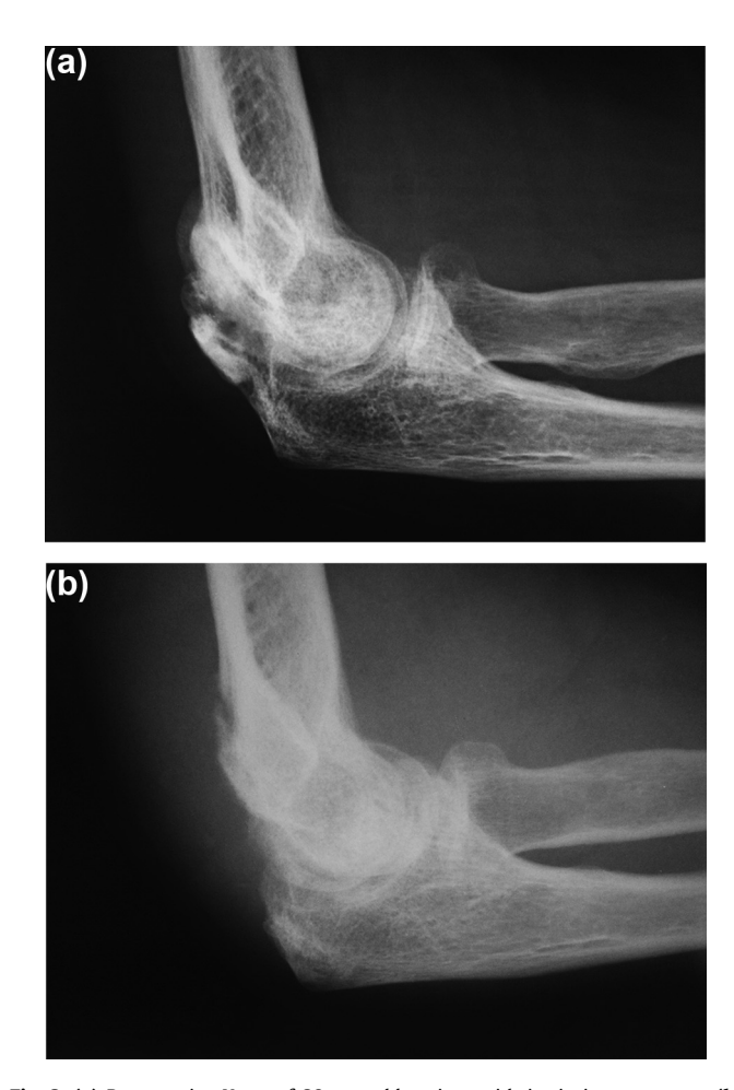
Fig. 3. (a) Preoperative X-ray of 28-year-old patient with intrinsic contracture. (b) Postoperative X-ray 6 months after surgery. It is imperative to completely remove pathological bone formation at olecranon fossa and spurs at the tip of olecranon.

Column procedure was first suggested for extrinsic contracture of the elbow. Subsequently, this procedure was used for both extrinsic and intrinsic types of contracture.<sup>6</sup> In this study, MCL and LCL were protected after resection of anterior and posterior capsule during operation on intrinsic contracture. After this stage, bone resection (olecranon, olecranon fossa, coronoid, and osteophyte of anterior wall of distal humerus) was performed according to pathology of intrinsic causes (Fig. 3a and b). ROM of the elbow was controlled under fluoroscopy. In patients with flexion limitation,