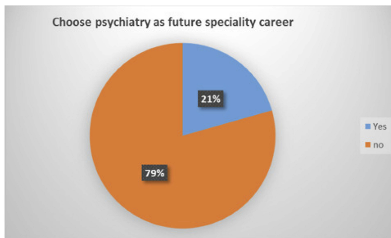
Figure 1 Medical students' choice of psychiatry specialty as future career.

shown psychiatry as a future career specialty than their counterparts (Figure 1 and Table 3).