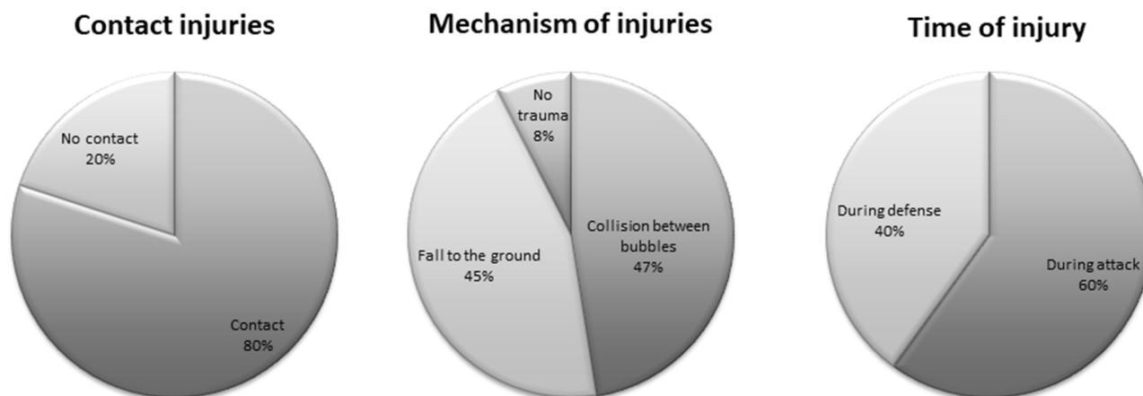
Figure 2 (A–C) Injury patterns in bubble-soccer.