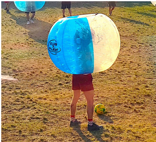
Figure 1 Player wearing a bubble.

group, 3,4,16,17 the consensus statement established by Fuller et al (2006) and the UEFA model for injury analysis in soccer. 18,19 Four weeks before the bubble-soccer tournament, all participating players were informed about the epidemiological injury investigation of the entire tournament. At the beginning of the tournament, all team captains were briefed on the study guidelines by email and in an instructional course in the morning of the match day. Additionally, each player received the study design and the questionnaire with informative consent in print. The questionnaire requested personal and anthropometric data, specific bubble-soccer data, injury patterns and factors influencing injuries. Of particular interest was information on match preparation, well-being and perception.