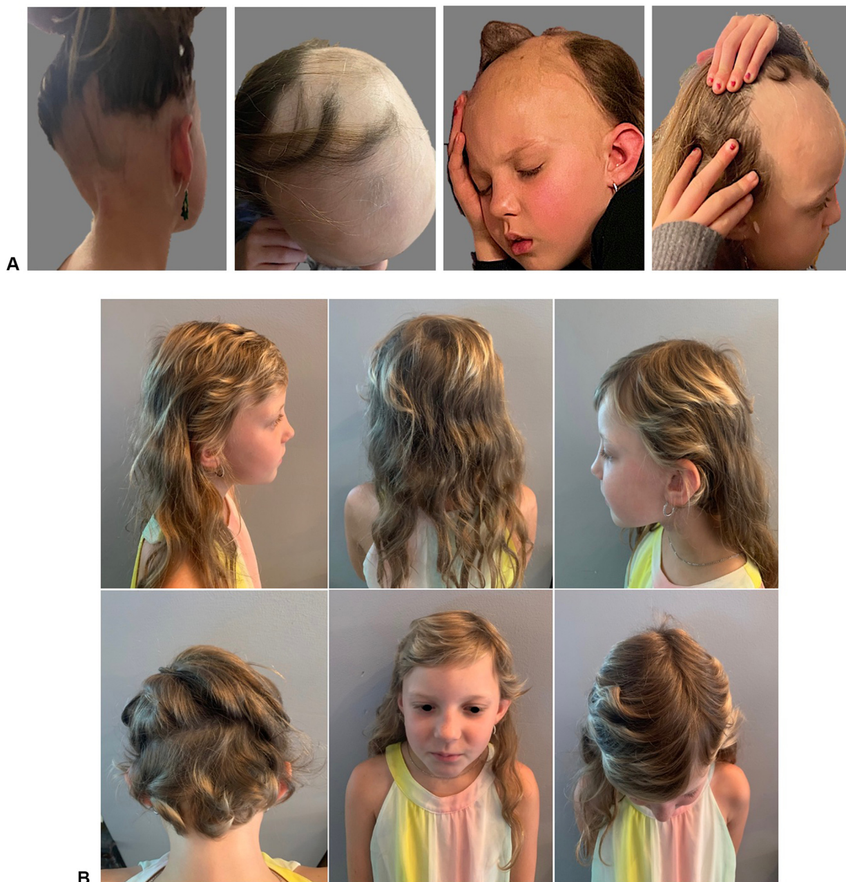
Fig 2. Photographs shared with consent of case 3 before (A) and after (B) 1 month of 10 mg of oral tofacitinib twice daily.