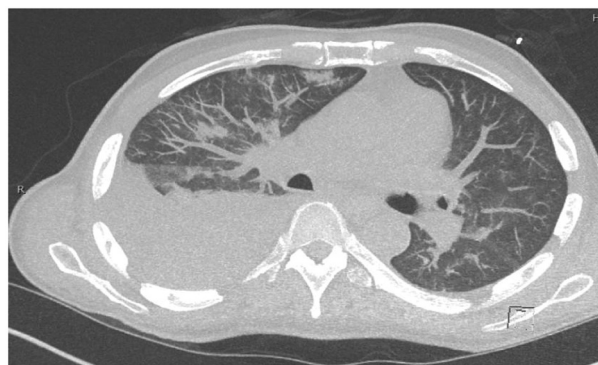
Figure 3. High-resolution CT chest above showing diffuse ground-glass opacity in the lungs and bilateral pleural effusion.

Table 1 Outlining the Kasukawa diagnostic criteria is shown above [6]. Based on the Kasukawa diagnostic criteria, a patient would be diagnosed with MCTD if they have \geq 1 common symptom, positive anti-RNP antibodies, and \geq 1 finding from each of \geq 2 disease