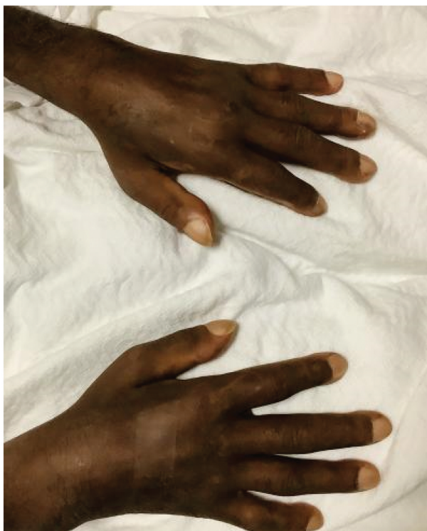
Figure 1. Bilateral soft tissue swelling of the hands with loss of skin crease and clubbing of the fingers.

In the emergency department, blood pressure was 166/119 mmHg, heart rate 130. He was breathing at 23 breaths per minute and saturating at 86% on room air. Physical examination was remarkable for moderate respiratory distress, with bibasilar crackles in the lungs and 1+ bilateral pedal edema. Motor strength 4/5 in all his extremities. Hands examination revealed clubbing, see Figure 1 .