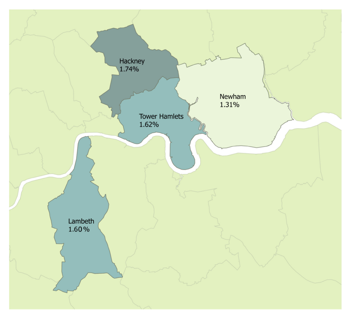
Fig. 1 Prevalence of severe mental illnesses across the study sites, by borough

(Table 2). Figure 1 highlights the geographical distribution of severe mental illness across the study sites.