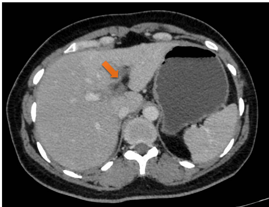
FIGURE 2: Abdominal CT scan showing a filling defect, indicating blockage of the left branch of the portal vein.

Blood test reports showed leukocytosis, increased fasting blood sugar up to 145mg/dl, gamma-glutamyl transferase levels were 90 U/L, alkaline phosphatase levels were 133 IU/L, and decreased albumin to globulin ratio of 1.05. D-dimer value was increased up to 2309 ng/L. Anticoagulant tests namely, Protein C, Protein S, Cardiolipin IgG, IgM, and IgA antibodies, and Factor V Leiden mutation, showed no deviation from the