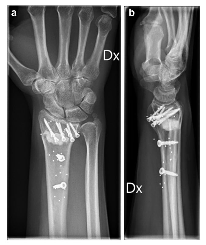
Fig. 4 Radiographs at 12 months control after osteotomy using bone substitute. a AP view. b Sagittal view

The Canadian Occupational Performance Measure (COPM). This tool is used as a semi-structured interview, where the patient selects three to five activities or tasks of personal importance and assesses his/her own capability