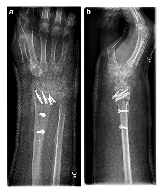
Fig. 6 Post-operative radiographs after open wedge osteotomy. a AP view. b Sagittal view

[39]. The results of this study indicate that, from the patient's perspective, it is worthwhile undergoing surgery, since the