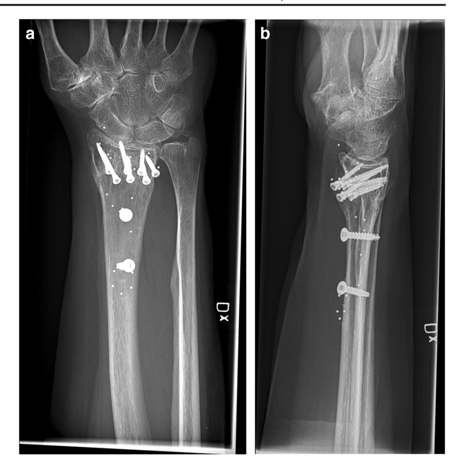
Fig. 7 Radiographs at 12 months control after open wedge osteotomy. a AP view. b Sagittal view

flexion has been shown to be sufficient for activities in daily life [40]. The improvement in radial and ulnar deviation was probably too small to be noticeable for the patients. The changes in supination, pronation and volar flexion were large enough for the patients to detect. Taken one by one, the changes are probably not clinically important, but the sum of all the changes together is, as the total range of motion arc increased, enabling the wrist to function more effectively in everyday life activities. For the control group, the recovery in range of motion was so large that there were no longer any differences compared with the non-injured side in supination, pronation and radial and ulnar deviation. Moreover, in the treatment group, the recovery was also large enough for the patients to reach range of motion close to the values on the noninjured side and, again, there were no significant differences between the groups.