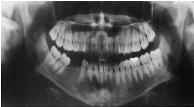
Figure 1. In panoramic radiography was revealed unilocular radiolucency in periapical area of anterior mandibular teeth.