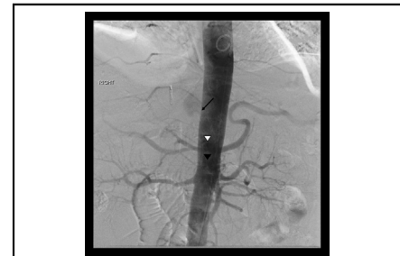
Angiogram demonstrating ACF just proximal to the celiac axis.