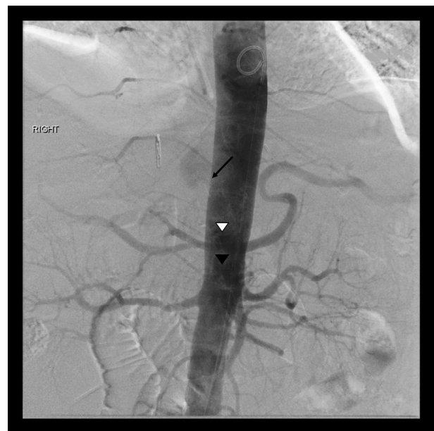
FIGURE 1. Aortogram demonstrating extravasation of contrast into gastric conduit via aorto-conduit fistula (ACF) (long arrow). The celiac (white arrowhead) and superior mesenteric artery (black arrowhead) are identified in close proximity to the ACF.