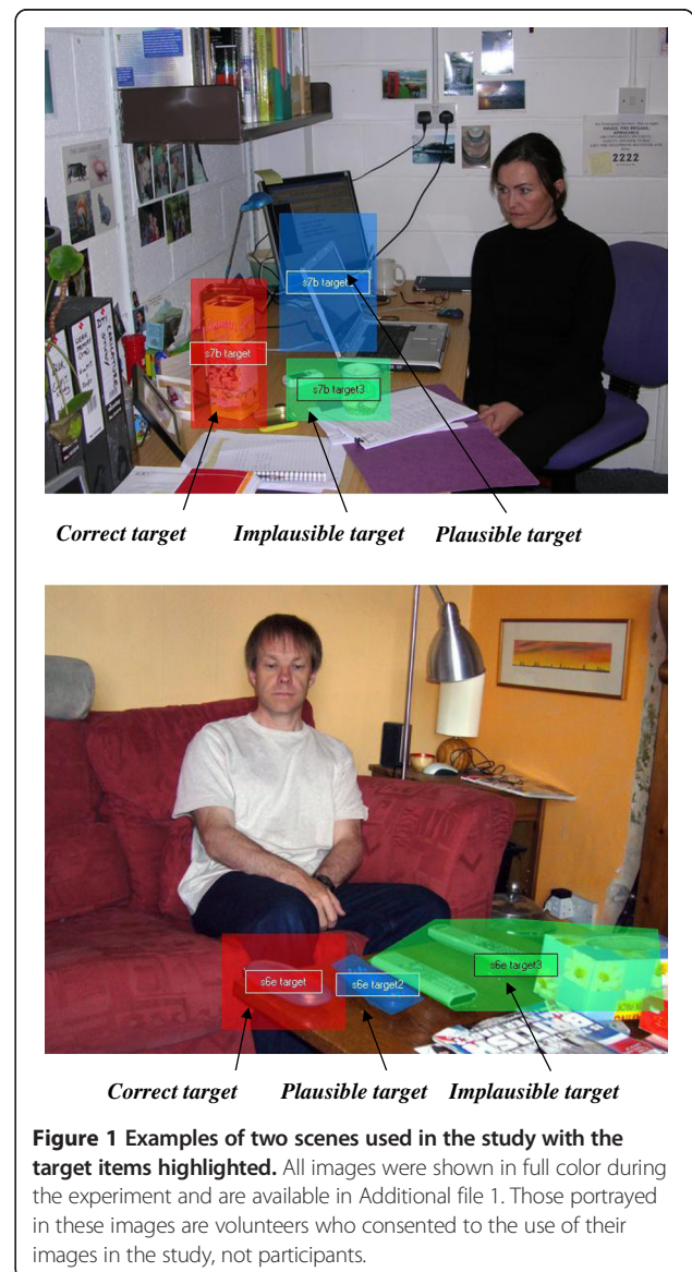
Figure 1 Examples of two scenes used in the study with the target items highlighted. All images were shown in full color during the experiment and are available in Additional file 1. Those portrayed in these images are volunteers who consented to the use of their images in the study, not participants.

in Additional file 1. The TobiiStudio package exported gaze fixation duration (milliseconds) to each AOI across scenes for each participant. We also recorded the time to first fixation on each AOI; these data are reported in Additional file 2.