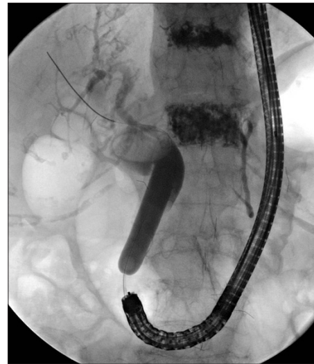
Fig. 1. Endoscopic retrograde cholangiopancreatography showing the CRE wire-guided dilation, 12 mm in diameter.

Olympus Optical Co., Ltd.) was attached to the tip of the endoscope. Prophylactic antibiotics and analgesics were permitted. All procedures were performed by two experienced endoscopists at each tertiary referral center. Selective cannulation of the CBD was achieved by wire-guided cannulation: a hydrophilic tipped guidewire (Jagwire; Boston Scientific, Natick, MA, USA), 0.035 inches in diameter, was preloaded into a pull-type papillotome