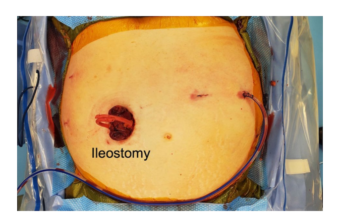
Fig. 2 Conclusion of operation with loop ileostomy creation

Once the distal transection is completed, the proximal transection point is identified and we take the mesentery using the vessel sealer to the wall of the bowel at this point. Perfusion is assessed by instilling indocyanine green using