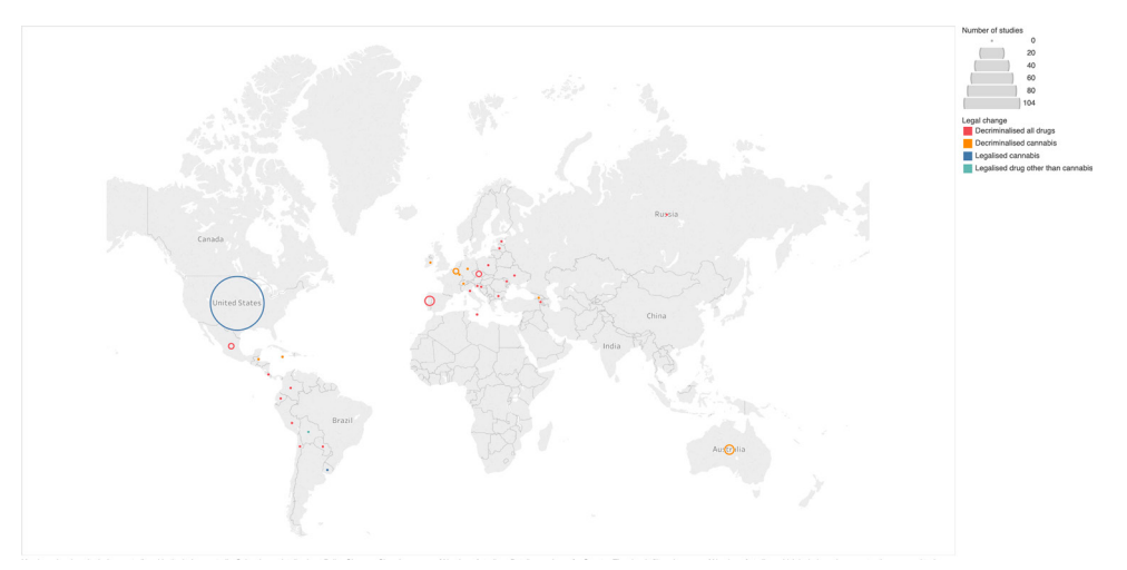
Figure 3 Number of included studies from countries that implemented decriminalisation or legal regulation by 2017. Note: Policy changes were classified, following the review inclusion criteria, based on the implementation of a change to national or subnational law to decriminalise drug use and/or possession or to legalise at least one class of drugs. We did not evaluate the extent to which legal changes were reflected in policing and criminal justice practice. Implementation of cannabis legalisation for medical purposes only is not reflected in this map.

Notably, one study assessed self-reported impaired driving, <sup>46</sup> while others assessed the proportion of fatally injured drivers screening cannabis-positive or the overall prevalence of driving with detectable tetrahydrocannabinol (THC) concentrations in blood. Remaining metrics were measured in less than 5% of studies (figure 1). Some pre-specified metrics were not represented in any of the articles, including infectious disease incidence (eg, HIV, hepatitis C), environmental impacts (eg, drug production waste, discarded needles) and labour market participation.