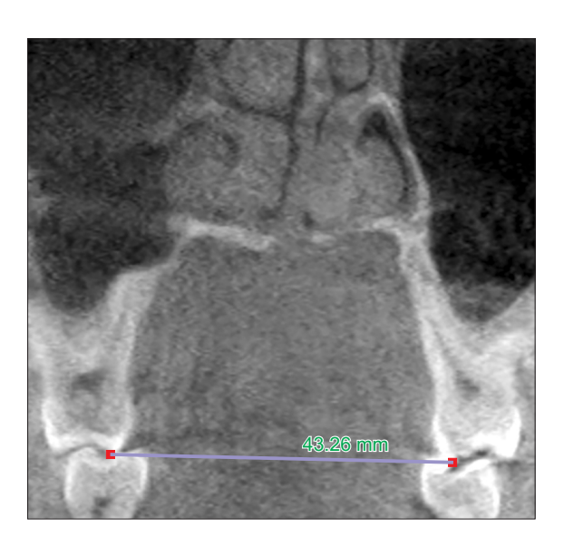
Figure 3. Measurement of the dental width. Measurement of the distance between the right and left mesiolingual cusps of the first molars on a coronal cone-beam computed tomography image.

Coronal CBCT images were reoriented such that the left and right mesiolingual cusp tips of the maxillary first molars were visible, and the dental width was measured between the cusp tips (Figure 3). These coronal images can appear similar to posteroanterior (PA)