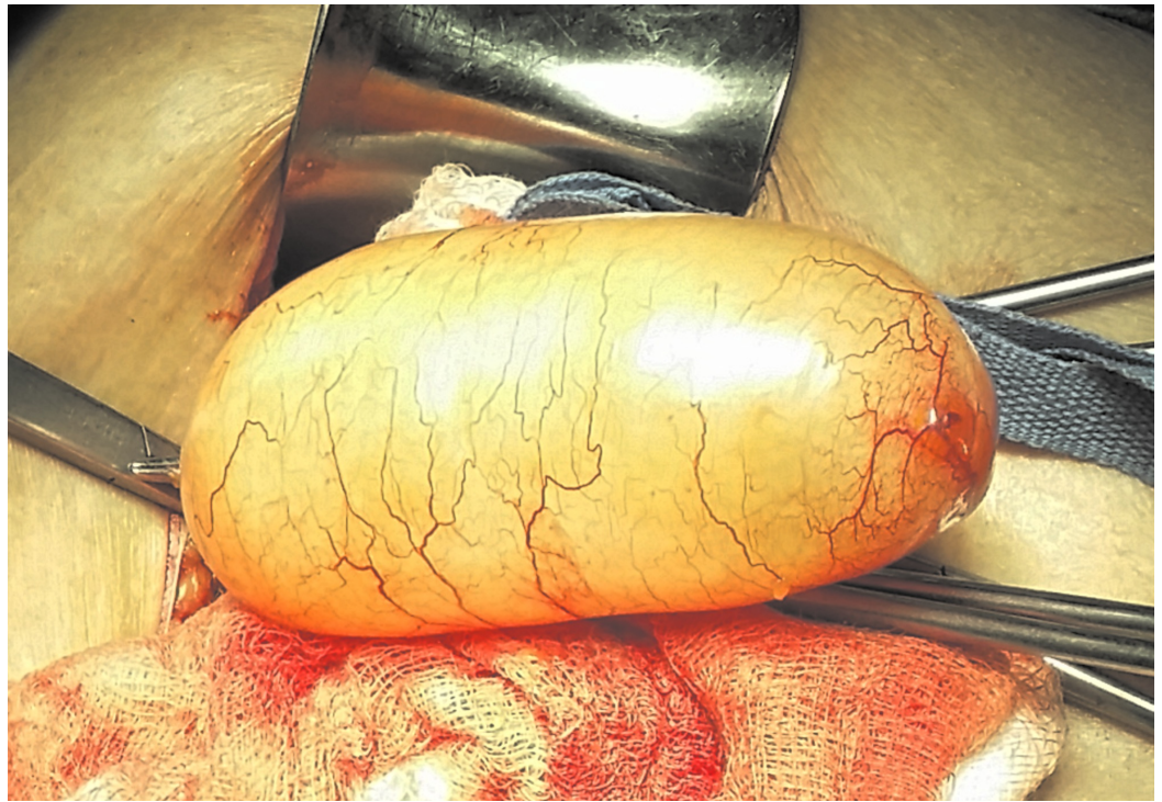
FIGURE 2: Intraoperative view of an appendiceal mucocele

A frozen section of the appendix specimen diagnosed cystadenoma. The postoperative course was uneventful. A pathological examination of the surgical specimen revealed a low-grade mucinous neoplasm of the appendix (Figure 3).